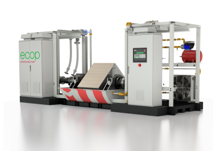
Rotation Heat Pump